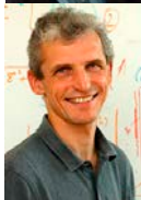
Wolfgang Ketterle , MIT Professor of Physics 2001 Nobel Prize Winner "For the achievement of Bose-Einstein condensation in dilute gases of alkali atoms, and for early fundamental studies of the properties of the condensates"