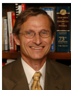
Richard R. Schrock , MIT Professor of Chemistry 2005 Nobel Prize Winner "For the development of the metathesis method in organic synthesis"