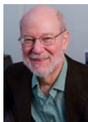
H. Robert Horvitz , MIT Professor of Biology 2002 Nobel Prize Winner "For discoveries concerning genetic regulation of organ development and programmed cell death"