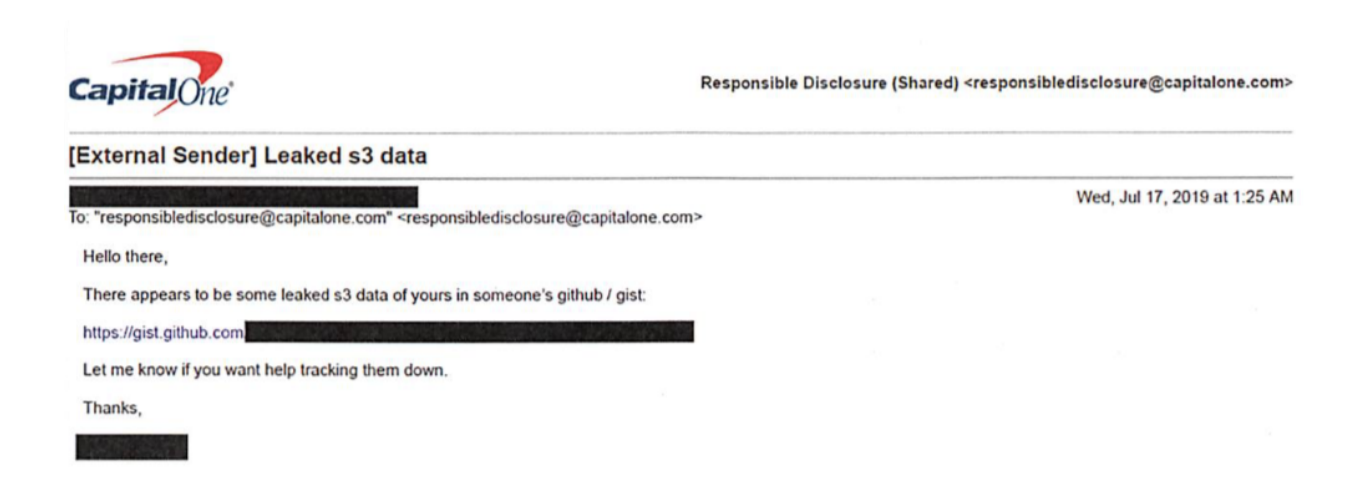
Figure 1 Email reporting supposed leaked data belonging to Capital One

Capital One reported via a press release (PRNewswire, 2019) that some of the stolen data was encrypted but the company did not provide any detail on how it was possible for the attacker to access the information: "We encrypt our data as a standard. Due to the particular circumstances of this incident, the unauthorized access also enabled the decrypting of data."