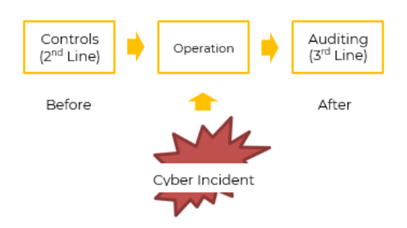
Figure 2: Cyber Incident window of opportunity

Organizations in general have the challenge to properly establish consistent compliance management across the different teams involved in handling compliance controls, usually organized as "defense lines" across large companies such as Capital One.<sup>10</sup> The management and assurance activities performed by the Risk, Compliance, Internal Controls, and both Internal and External Audit teams, have by definition their role in a different time and space where cyber incidents can materialize (see Figure 2).