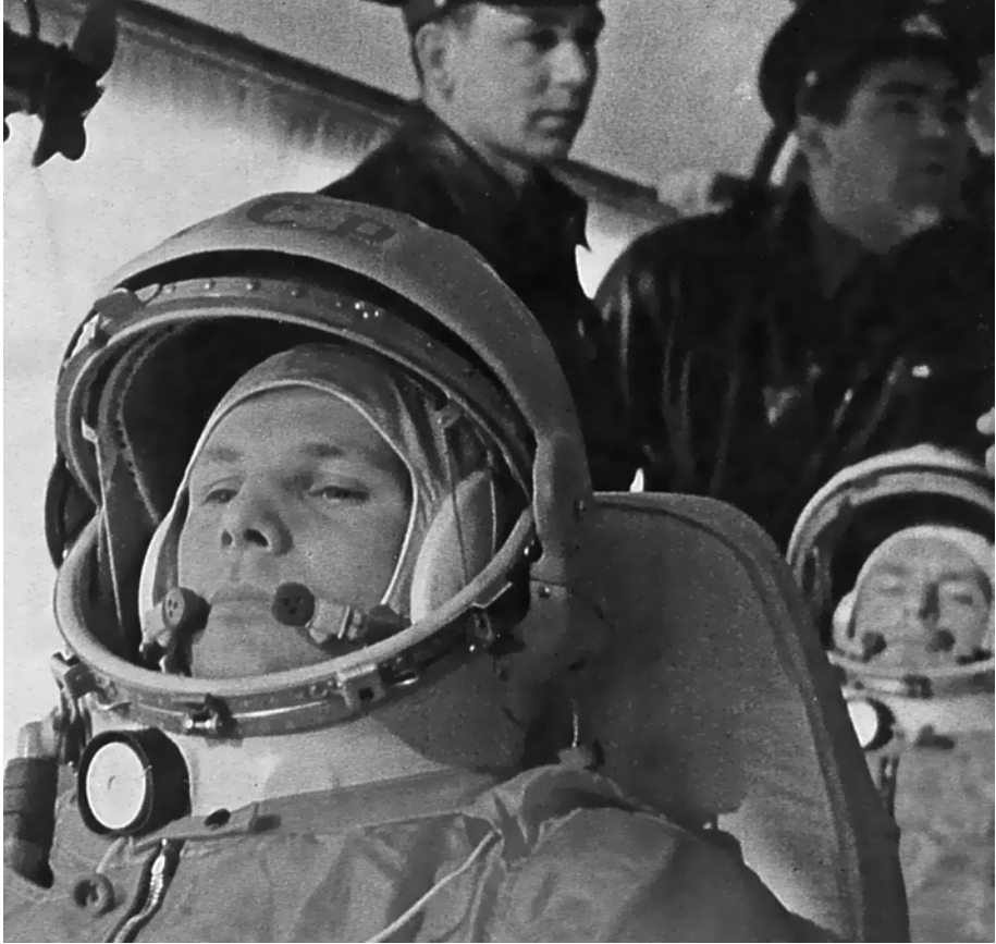
A pensive Yuri Gagarin is in the bus on the way to the launchpad on the morning of 12 April 1961. Behind him, seated, is his backup, German Titov. Standing are cosmonauts Grigoriy Nelyubov and Andrian Nikolayev. Gagarin began his cosmonaut training in 1960, along with 19 other candidates. On 12 April 1961, Gagarin lifted off in the automated Vostok 1 spacecraft, and after a 108-minute flight, he parachuted safely to the ground in the Saratov region of the USSR. As the first human to fly in space, he successfully completed one orbit around Earth. After his historic flight, Gagarin became an international symbol for the Soviet space program, and in 1963, he was appointed Deputy Director of the Cosmonaut Training Center. In 1966, he served as a backup crew member for Soyuz 1, and on 17 February 1968, he completed a graduate degree in technical sciences. Tragically, during flight training in a UTI-MiG-15 aircraft on 27 March 1968, Gagarin was killed when his plane crashed.