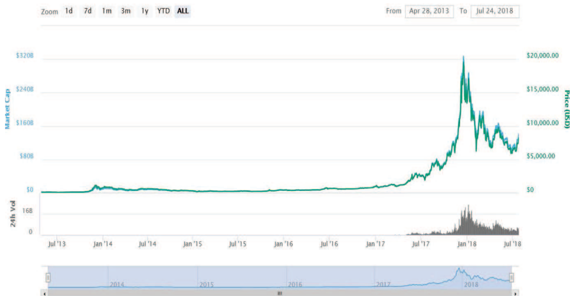
Figure 1: Bitcoin Price, July 2013 to July 2018