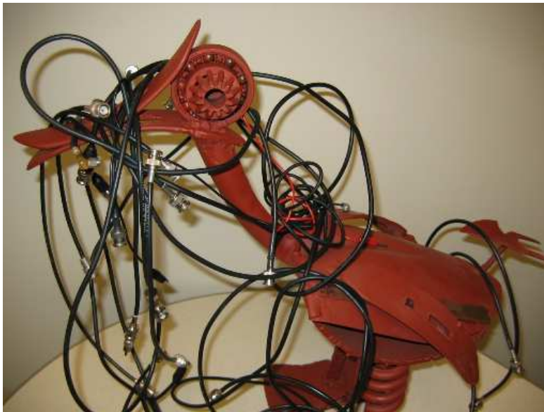
Figure 4: . . .but often gets tangled in wires and cables.