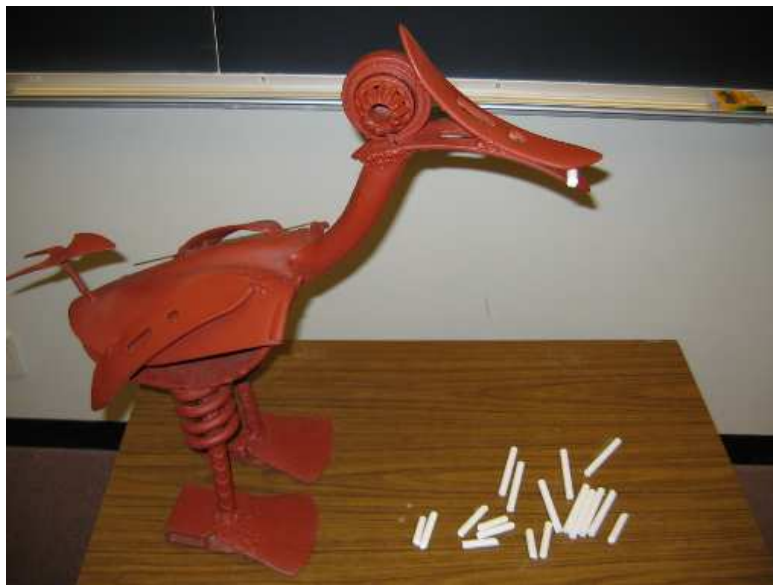
Figure 6: The mathematician duck consumes great quantities of chalk. Students often find the duck's behavior confusing and frightening.