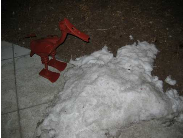
Figure 1: The great northern shoveler makes its home in California. However, on rare occasions, the mathematician duck has been observed getting lost on migratory travels. This specimen is clearly confused by the sight of snow.