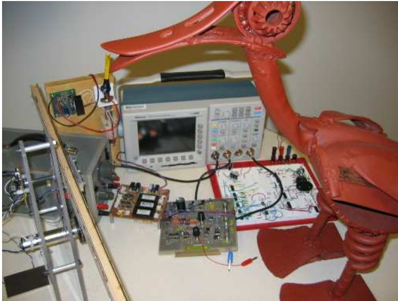
Figure 3: The mathematician duck is comfortable in the electrical engineering laboratory and is proficient with an oscilloscope . . .