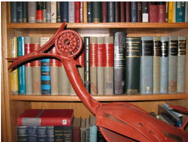
Figure 8: The mathematician duck is known to collect books to line its nest.