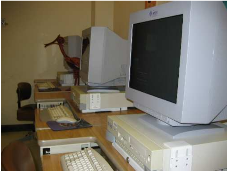
Figure 7: The plumage of the mathematician duck is a natural camouflage among computers. This duck has a sore neck from long work days of pecking at the keyboard.