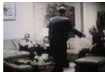
A justice of the Peruvian Supreme Court caught on videotape accepting a bribe from the de facto head of Peruvian intelligence (who made the tape and is now himself in jail)