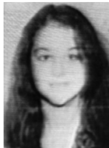
Berenson at the time of her arrest in 1995

The whole thrust of the piece was to reinforce the link between Lori and a terrorist group, which just happens to be the thrust of what Fujimori and Co. have been trying to convince the world of as well. Van Sant righteously demands on camera that Lori "denounce" the MRTA, which it describes as the terrorist group she is accused of supporting. Ironically, Peru has since dropped its charge that she was a leader of the MRTA. But CBS has, in effect, not. Remember, Lori is in prison with MRTA prisoners. To turn against them could be suicidal.