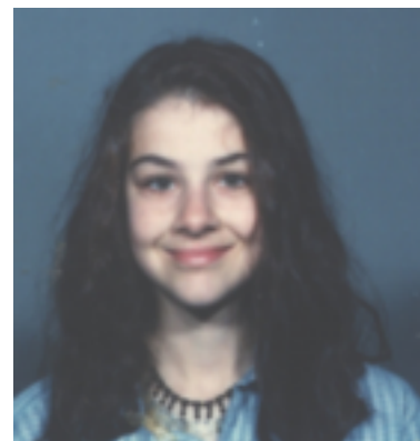
Berenson as an incoming first-year student at MIT

June 21, 2001 Update: Activist and indy journalist Lori Berenson was convicted yesterday by a Peruvian court for "terrorist collaboration" and received a 20-year sentence. She will be released in 2015, with credit given for the five years she has already served. She is appealing and continues to protest her innocence. (See FreeLori.org for her statement to the court.) While the facts are contested and muddled, most coverage of her conviction has included neither the many international indictments of Peru's judicial system nor the role the media, there and in the United States, played in convicting her earlier in the court of public opinion.