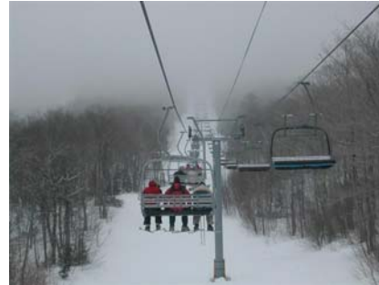
Aero/Astro students enjoy Jay Peak.

Social Events RECENT : Jay Peak Ski daytrip was held on February 22nd. 55 people from MechE and Aero/Astro attended (see right). UPCOMING : Wine & Cheese Social (faculty, staff, and grad students). Tentatively Thursday, March 18, 4 - 6pm. UPCOMING : Volunteer Day.