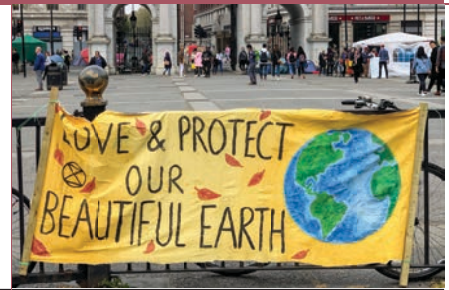
Marble Arch, Greater London

in this issue we offer commentary on the increasing concern around climate change “Time to Up Our Game” (below), and “An Update on MIT’s Climate Action Plan” (page 6); introduce the new Chair of the Faculty (page 8); report on MIT’s Random Faculty Dinners (page 10); and write on the Faculty Committee on Campus Planning (page 14).