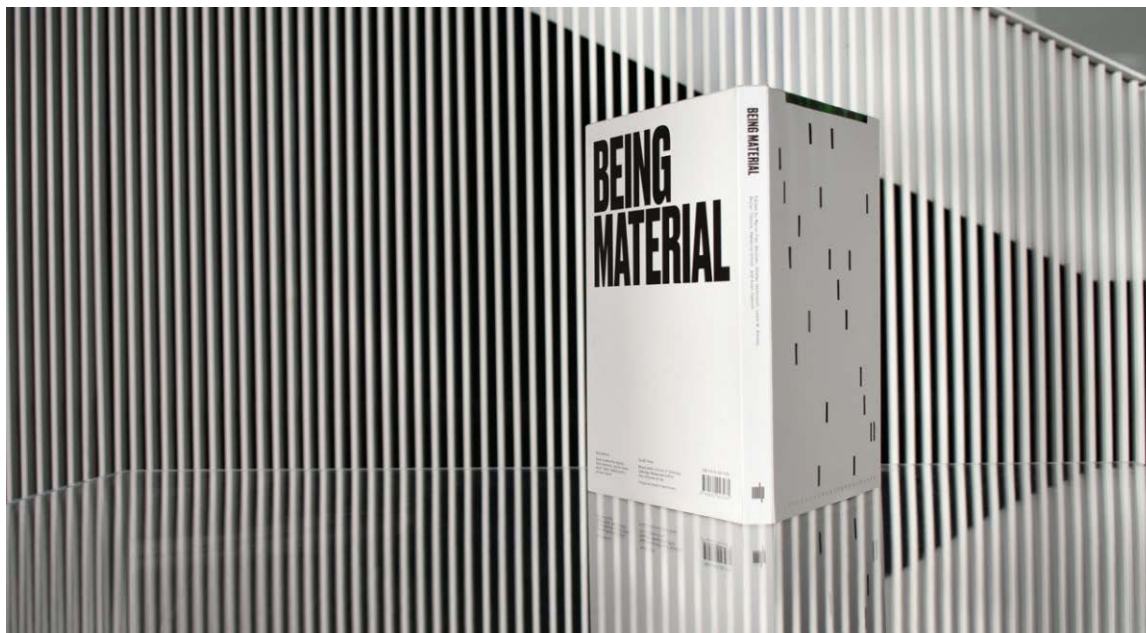
The award-winning cover design of Being Material (The MIT Press, 2019. Photo by H. Erickson)

October 2019. An expansion of the CAST symposium held in April 2017, the book was designed to be a physical as well as digitally activated object using machine learning and computer vision to interact with a companion website. The American Institute of Graphic Artists recognized Being Material in March with a 50 Books | 50 Covers award. In AY2020, along with eight continuing projects, CAST awarded $257,500 in funding for 12 projects commencing in AY2021 from a total of 17 submissions, including new awards for three International Exhibition and Performance Grants, six visiting artist grants, and three Fay Chandler Creativity Grants.