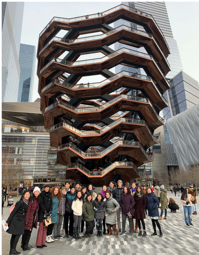
Arts Scholars visit 2020 McDermott Award winner Thomas Heatherwick's Vessel during an excursion to New York City.

The Arts Scholars calendar included excursions to on-campus and local arts events as well as the annual trip to New York City. An expert in the relevant discipline accompanied students on each excursion for dinner and conversation. After COVID-19 necessitated the students' departure from campus, the Arts Scholars convened virtually for a series of arts shares, livestream events, and panel discussions. Whether on campus or remote, these discussions facilitate learning from the expertise of the guest(s), and the arts experiences themselves positively affect students' lives and their studies at MIT. In AY2020, 60 students participated as Arts Scholars, including 40 undergraduates and 20 graduate students. Their courses of study ranged from engineering and the sciences to management and media.