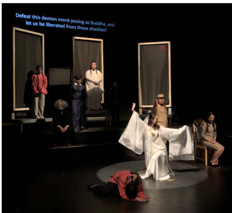
CAMIT grant recipient MIT Wuming Theater Club.

The council also continued the director's grants program, which awarded $2,747 to support eight projects by and for undergraduate students and student groups, and continued supporting a seed fund for projects by graduate students in the MIT Program in Art, Culture, and Technology (ACT).