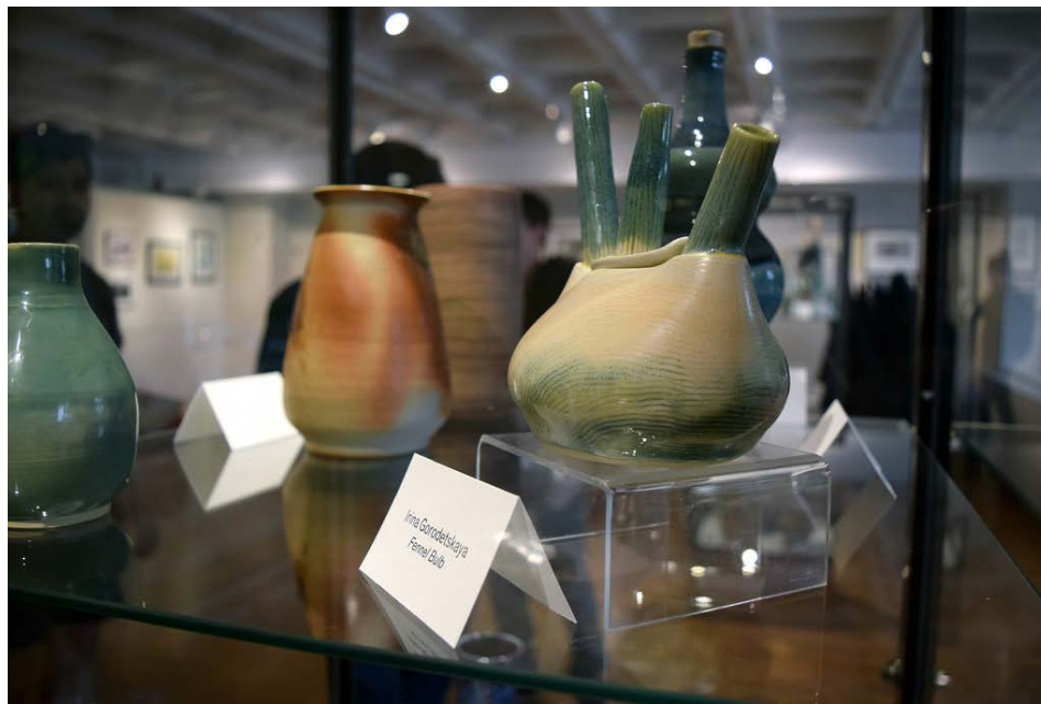
Work exhibited at Art Show! An MIT Student Art Association Contemporaspective in the Wiesner Student Art Gallery.