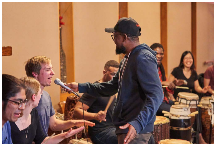
BIC with Rambax MIT.

The cross pollination of Kreyòl linguistics, poetry, computer science, and music continued at MIT for one week in April 2019. As part of MIT Sounding, BIC performed his work at the Kafe Kreyòl on April 3 and on campus on April 5 in collaboration with musicians, dancers, and performers from MIT and the greater Cambridge area. BIC’s residency included workshops in Kreyòl digital poetry and storytelling through dance and movement, visits to four classes ranging from popular world music to contemporary social and linguistic challenges of the black diaspora, and rehearsals with Rambax MIT. The residency aimed to facilitate opportunities for both the MIT community and the broader Haitian community in and around Boston to experience new cultural expressions of digital poetry and music making in Kreyòl.