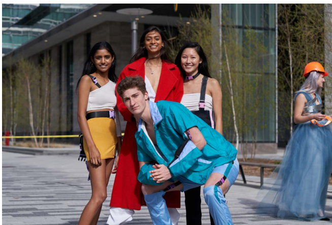
Students taking part in the LIMINAL fashion show during MIT Design Week.

Ten undergraduates and student groups, 10 graduate students, five faculty members and lecturers, and seven staff members received funding this year. In addition to this support, the grants committee continued the director's grants program, which awarded $7,840 to support 18 projects by and for undergraduate students and student groups. The committee also continued to support a seed fund for projects by graduate students in the MIT Program in Art, Culture and Technology.