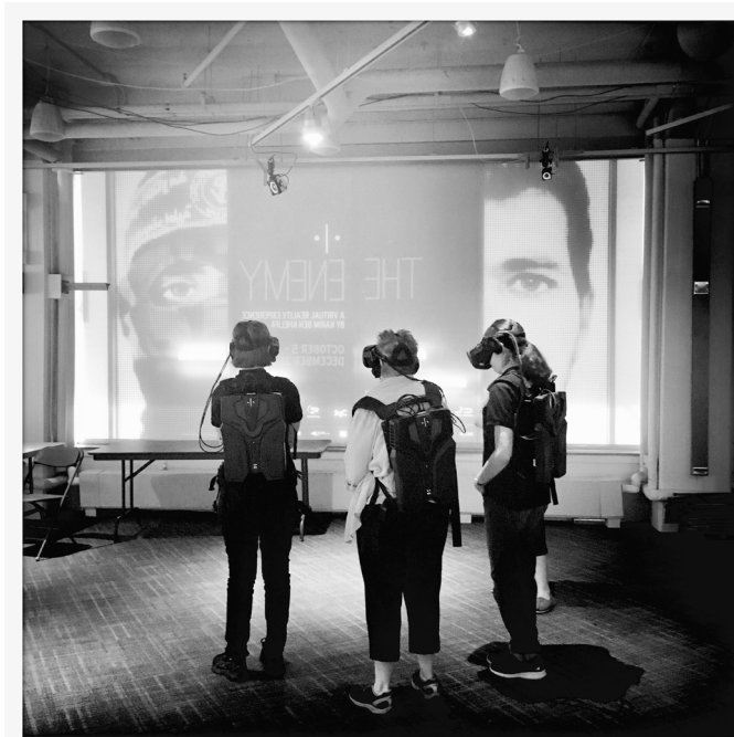
Visitors experience The Enemy, a virtual reality exhibition at the MIT Museum.

The Enemy (October 2017 to December 2017) was an innovative research and technology experiment, focusing on contemporary social issues from around the globe. It tested new modes of audience engagement (virtual reality) while fostering socially relevant conversations and building greater awareness of the museum.