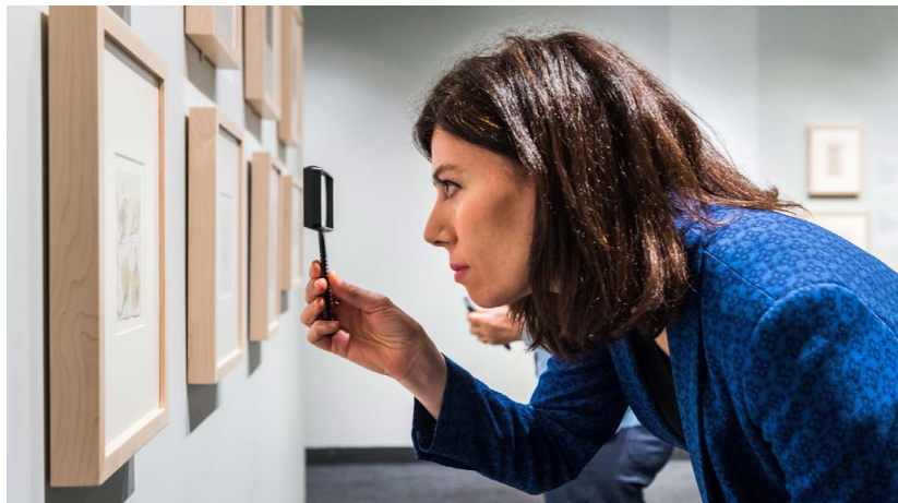
A visitor takes a closer look at one of Santiago Ramón y Cajal's drawings in The Beautiful Brain exhibition at the MIT Museum.

The Beautiful Brain: The Drawings of Santiago Ramón y Cajal opened in May, and was celebrated on May 7, 2018 with robust attendance by MIT faculty, neuroscientists, and the larger community of supporters. Santiago Ramón y Cajal, who made transformative discoveries of the anatomy of the brain and nervous system, is considered the founder of modern neuroscience and also an exceptional artist. These historical works are complemented by contemporary visualizations, many from MIT laboratories, bringing to view new understandings of the brain, enabled by developing technologies in the field of brain and cognitive science. The Exhibitions team collaborated in the yearlong development of the MIT components with the McGovern Institute, Department of Brain and Cognitive Sciences, and the Picower Institute.