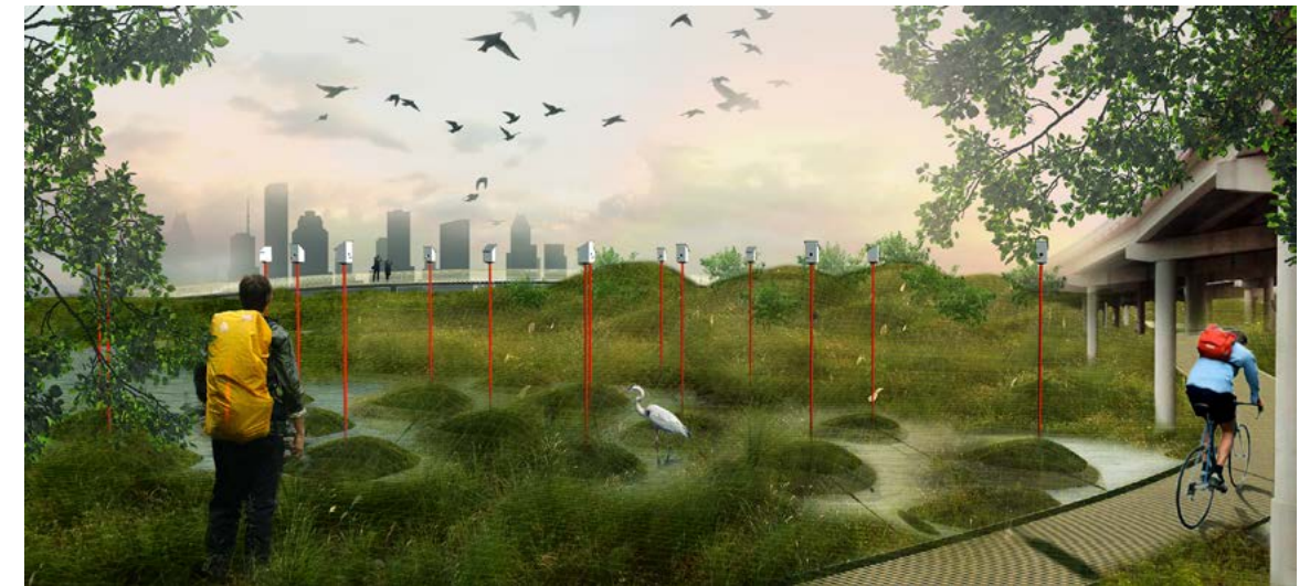
Illustration from Design Guidelines for Urban Stormwater Wetlands.