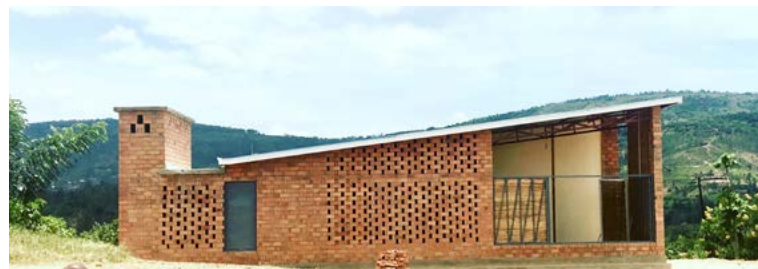
Constructed housing prototype in Kigali, Rwanda.