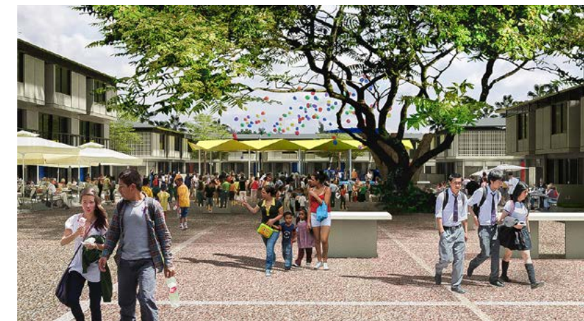
A neighborhood workspace and inner clustered courtyard.

The workshop investigated a livelihood-based approach to the idea of "home" — where the neighborhood supports both living and working — for a superblock in Ciudad Bicentenario, a new affordable housing community being built in Cartagena. The MIT team worked with Fundación Mario Santo Domingo, known in Colombia for building "habitats," including infrastructures such as schools, child-care centers, health services, and recreation facilities. Employing their model focusing on community and social infrastructure to create livable spaces, the team proposed solutions for live-work typologies at the block, neighborhood, and house scales. MIT students engaged with local stakeholders, FMSD, and local university students to develop a master plan, public realm strategies, and housing typologies. The workshop's leaders were Adèle Santos and Debora Mesa.