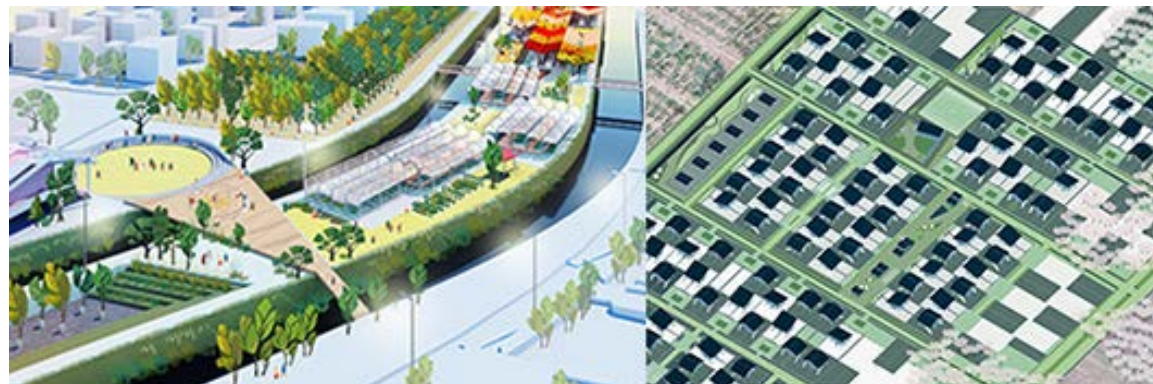
Proposed cluster formation for a new twin housing system in Sophia, Guyana. The system will leverage existing infrastructure to develop public space and agricultural production. (Credit: Giovanni Belotti)

The workshop explored aspects of public infrastructure, flooding, and community development as they relate to housing in the neighborhood of Sophia, located approximately three miles east of downtown Georgetown. The redevelopment of the major north-south canals and their flanking reserves is the focus for building a strong community open space and amenity infrastructure. Since these reserves represent the divisions between neighborhoods, this approach creates mutual areas of emphasis. The linear development contains a community marketplace and spaces for intensive agricultural production that could serve markets within and beyond Sophia. The proposed new twin houses involve inherent cost savings, and these structures are clustered to reduce costs further. This housing arrangement also allows for greater public space and new community typologies. Workshop leaders were Adèle Santos and Marie Law Adams, with collaboration from the Central Housing and Planning Authority of Guyana, the Inter-American Development Bank, the MIT International Science and Technology Initiatives Global Seed Funds, and the University of Guyana.