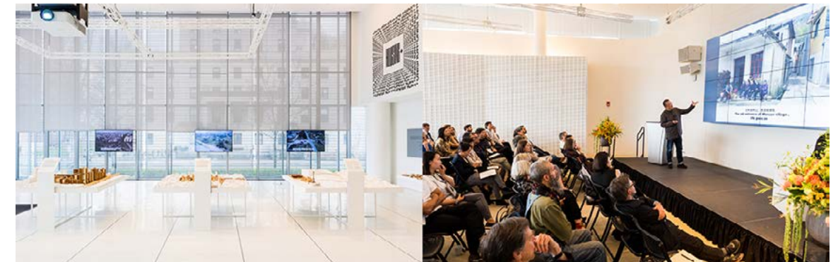
Housing+ on display in the Media Lab's Okawa Lobby Wang Shu, dean of the School of Architecture at the China Academy of Art, delivers the Charles Correa (1955) Lecture on Housing and Urbanization, which explored the "publicness" of housing in China.

The Housing+ conference extended the design dialogue beyond the scale of the housing unit. Panels investigated how housing interacts with aspects of urbanity such as public space and infrastructure. Speakers addressed the challenges that designers face in the housing sector, including those related to affordability, resilience, health, and sustainability.