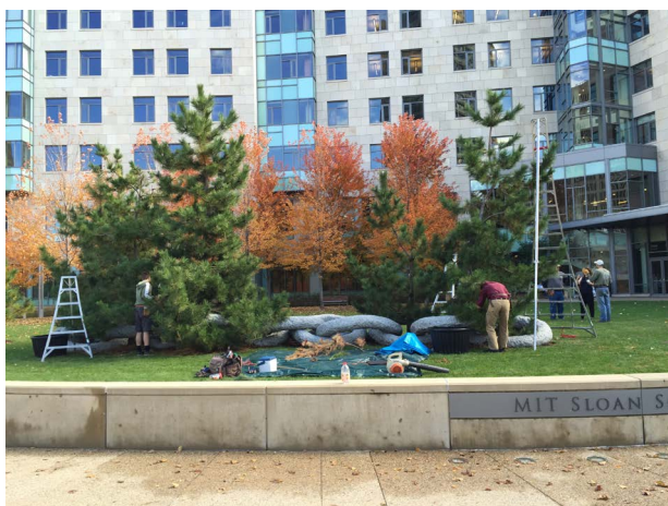
Cai Guo-Qiang's Ring Stone receives pruning treatment by Hanselman Landscape and Gardens.

Elmo-MIT (1963, bronze); Jacques Lipchitz, Sacrifice III (1949–1957, bronze), Hagar in the Desert (1957, bronze), Bather (1923–25), Birth of the Muses (1944–1950, bronze); Henry Moore, Three-Piece Reclining Figure, Draped (1976, bronze), annual maintenance of bronzes by Rika McNally & Associates, July through August 2015; Henry Moore, Reclining Figure (1963, bronze), conserved by Daedalus, August 2015; Frank Stella, Loohooloo (1994, room-size installation, and acrylic on fiberglass), annual maintenance by Williamstown Art Conservation Center, August 2015; Cai Guo-Qiang, Ring Stone (2010, granite and seven Japanese black pine trees), pruning, treatment by Hanselman Landscape and Gardens, Manheim, PA, October 2015 and June 2016.