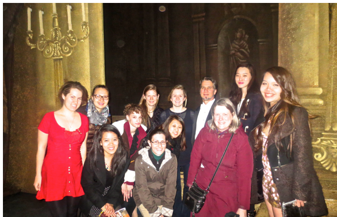
Arts Scholars at La Bayadere, Boston Ballet 2014.