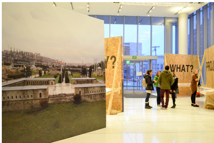
“Public Space? Lost and Found” exhibition displays work from students of artist Antoni Muntadas, professor of the practice in the Art, Culture and Technology program.

Part of a new initiative on arts and entrepreneurship, Hacking Arts was the first annual festival and hackathon co-presented with students in MIT's Sloan School of Management. At the event, 253 attendees heard from entrepreneurial leaders in a range of creative fields, viewed demos from new startups, experienced tech-enabled live performances, and developed their own tech-based business ventures in the space of 48 hours.