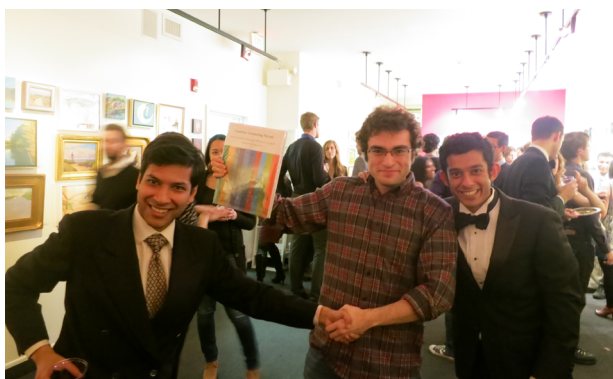
Graduate students at the Copley Society for Art.

This year's forums included a very successful Arts Showcase with over 500 graduate students in attendance and approximately 50 MIT artists showcasing their work. The fourth annual private gallery opening took place at the Copley Society of Art, America's oldest nonprofit artist collective. Other forums included painting workshops and dorm-specific community-building activities. An event held in collaboration with AAX allowed current graduate students and more than 70 MIT alumni to mingle and share their interests in the arts.