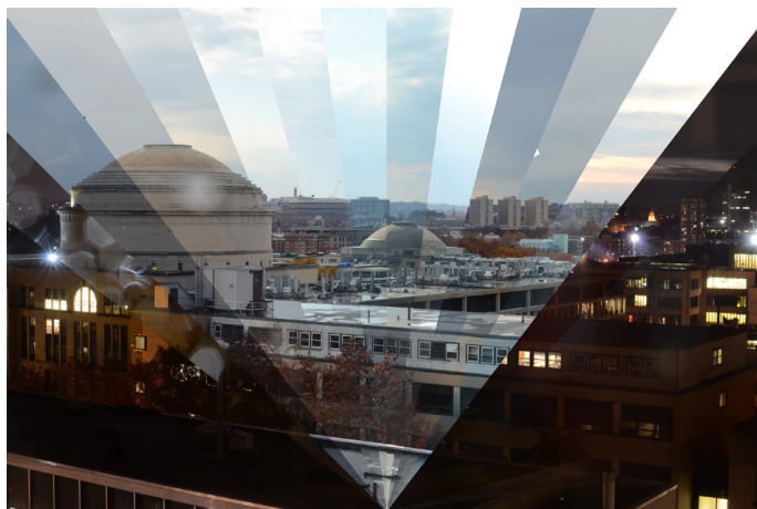
MIT student Melissa Schumacher photographs time at different scales.

The course 4.110/MAS.330/MAS.650 Design Across Scales, Disciplines and Problem Contexts explored the relationship between science and engineering through the lens of design. Design thinking has become increasingly integral to the contemporary practice