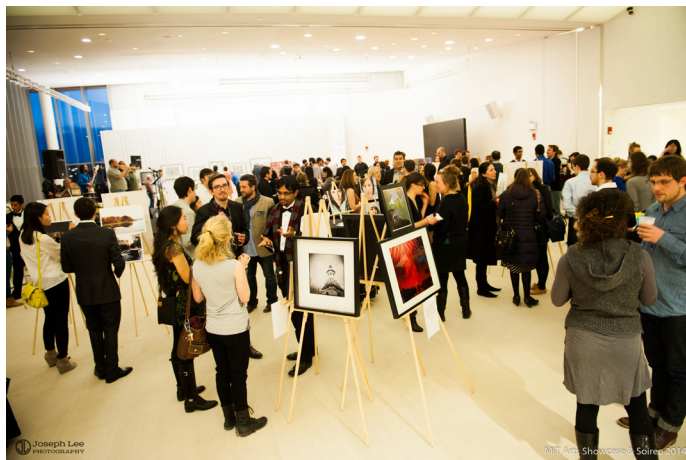
Alumni Arts Exchange and Grad Arts Forum at the Pi Day Launch party on March 14, 2014.

This new program, created in partnership with the Alumni Office, engages alumni interested in the arts in arts-focused networking events in order to cultivate conversation and community locally and eventually nationwide. Attendance and feedback for the first, pilot year of the program surpassed our goals, as measured against attendance at similar affinity groups sponsored by the Alumni Association (for example, MIT10 events). Our five-year plan calls for regional expansion in the coming year, and we will plan events in various cities in conjunction with performances or exhibitions by MIT creative arts faculty. We will continue to build this crucial community, which will nurture goodwill and support for the arts at MIT.