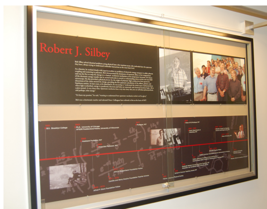
The Silbey display case outside the new Chemistry Education Offices.