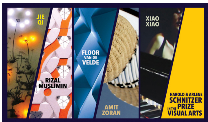
Poster for the 2013 Harold and Arlene Schnitzer Prize in the Visual Arts, designed by the winners.