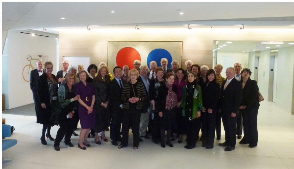
CAMIT in Toronto at the office of Polar Securities.