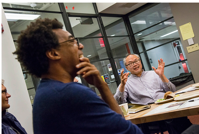
Visiting artists Rick Lowe and Mel Chin.