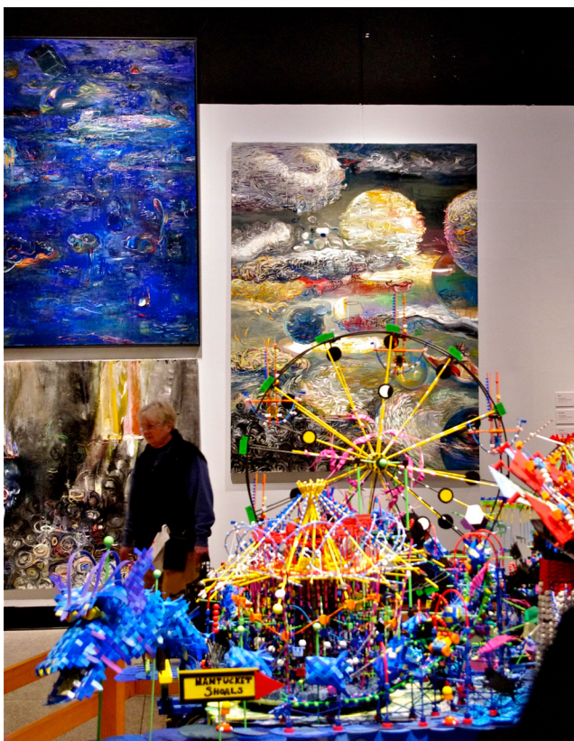
Installation shot of the Ocean Stories: Synergy exhibition at the Museum of Science.