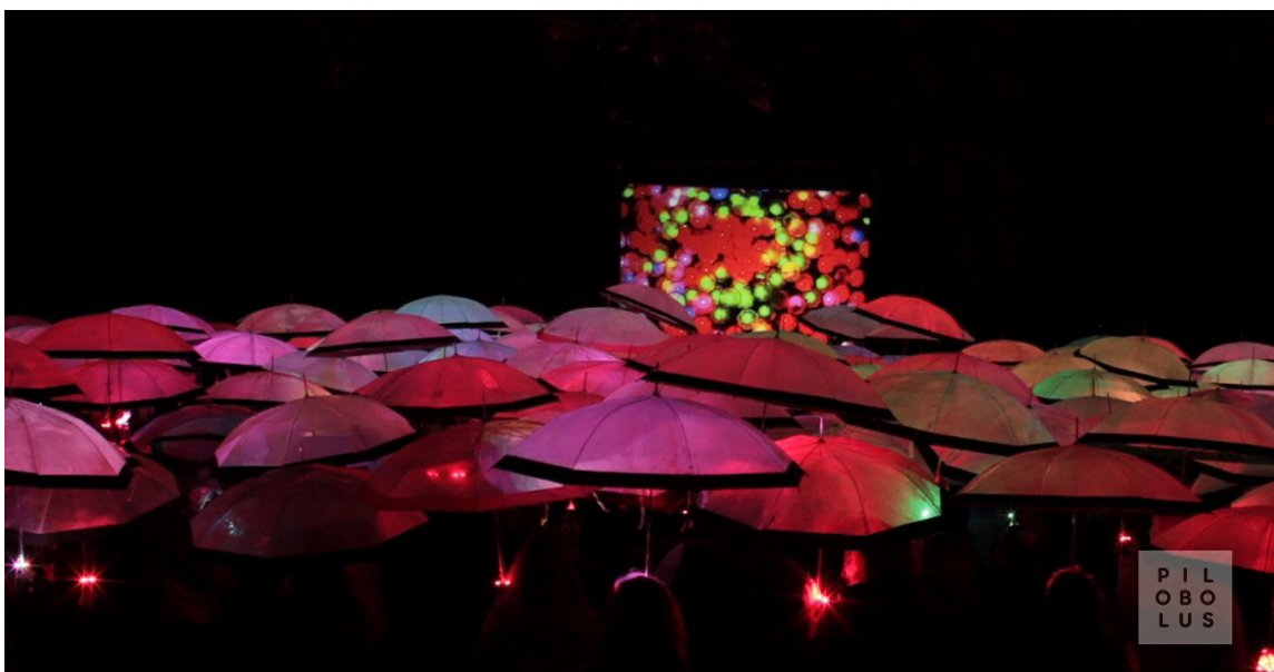
CSAIL partnered with the dance company Pilobolus to create “UP: The Umbrella Project.”