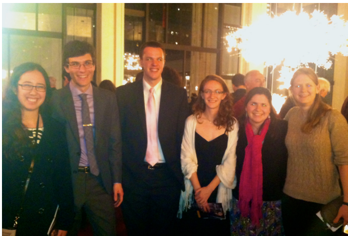
Arts Scholars at the Metropolitan Opera House.