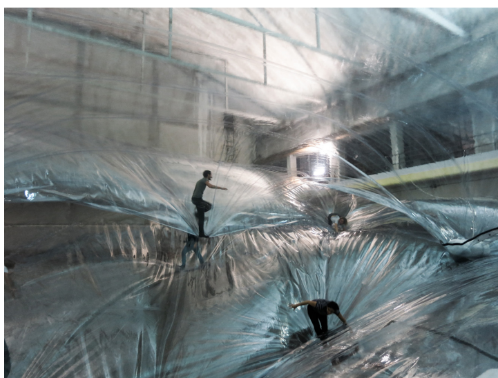
Tomás Saraceno's inflatable installation, On Space Time Foam, at Milan's Hangar Bicocca. Credit: Studio Tomás Saraceno

Visionary artist Tomás Saraceno met with over 20 scientists, architects, and engineers across the Institute for far-ranging conversations about biomimicry, cosmology, atmosphere, and flight. Saraceno creates inflatable and airborne biospheres that make tangible the complex systems of interaction, both physical and social, between humans and their environment. Taking the shape of soap bubbles, spider webs, neural networks, and cloud formations, these works are speculative models for alternate ways of living. Swinging between the practical and the speculative, Saraceno discussed everything from nano-engineered materials to solar energy to weather patterns to the origins of the universe, asking scholars in these diverse disciplines to imagine what different realities might look like.