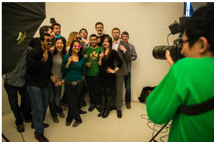
Graduate students at the March 2013 Arts Showcase.