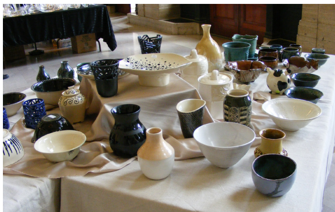
Example of pottery made at the Student Art Association studios.

The Student Art Association is a suite of three studios, founded in 1969, that provides space for hands-on exploration of the visual arts, photography, and ceramics. The SAA offers more than 70 student-focused extra-academic classes during the fall, spring, summer, and Independent Activities Period. Four instructors offer 15–20 classes each term. The Student Art Association enrolled approximately 600 MIT community members this year, close to 60% of whom were matriculated MIT students; the balance consisted of staff, alumni, and spouses of students, staff, and alumni. SAA offers 24-hour access to its members enrolled in ceramics, photography, drawing, painting, and open studios. The SAA has enjoyed steady growth and provides university-level arts instruction in a relaxed, creative atmosphere.