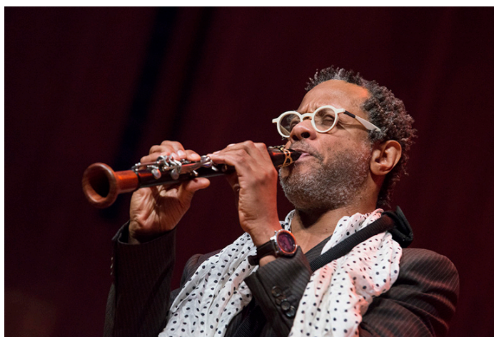
Visiting artist Don Byron.