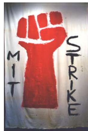
Newly acquired and restored banner that hung in Lobby 7 during the nationwide campus strike in May 1970.