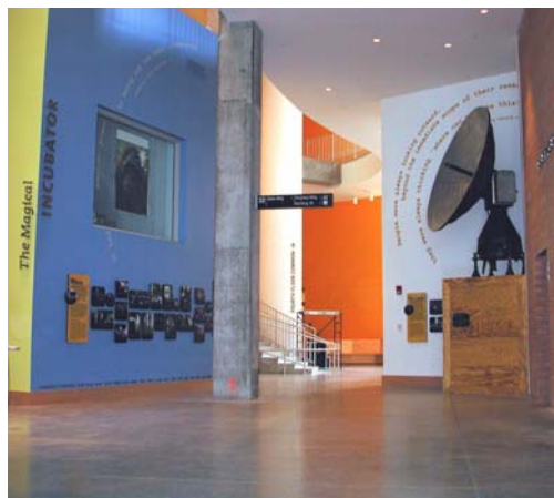
The Magical Incubator exhibition commemorating Building 20, installed in the Alexander Dreyfoos Lobby of the Stata Center.

The curator helped manage as well as curate the new Building 20 memorial Magical Incubator , a permanent exhibition installed in the Alexander Dreyfoos Lobby of the new Ray and Maria Stata Center. A particular highlight of this project was the restoration and installation of the SCR-615B radar antenna, designed by the Rad Lab and used by the Meteorology Department of MIT as part of its pioneering work in weather radar technology. The MIT Museum is grateful for the support of Lincoln Laboratory that enabled this display of one of our most valuable artifacts.