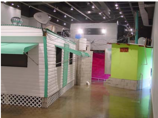
Marjetica Potrc's shantytown installation was written up in the New York Times.

First US presentation of works by Warsaw-based artist Artur Zmijewski, of moving and sometimes humorous works dealing with relationships between the so-called normal and the so-called disabled.