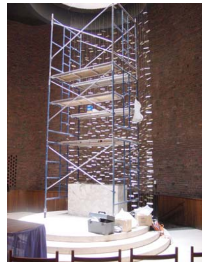
Harry Bertoia's Altarpiece being restored in the MIT Chapel.