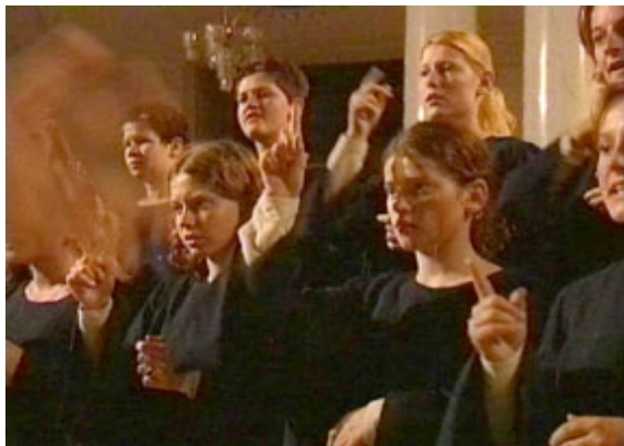
An image from one of the eight films presented by Polish artist Artur Zmijewski in the spring.