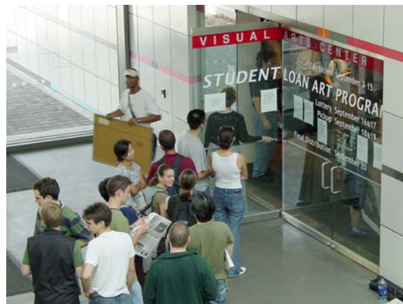
MIT students lined up early for a chance to borrow artwork from the Student Loan Art Collection.

—Provided training for 16 interns from the Rhode Island School of Design, Massachusetts College of Art, School of the Museum of Fine Arts, Yale University, Harvard University, University of North Carolina, Art Institute of Boston, and Art Institute of Chicago, as well as individuals who have completed school.