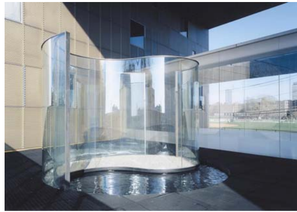
Dan Graham's Yin/Yang Pavilion, a Percent-for-Art project, has been very well received by the students of Simmons Hall.

—Provided three receptions for graduate students.