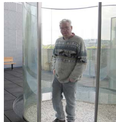
The artist Dan Graham emerging from his Yin/Yang Pavilion during the dedication of the work.