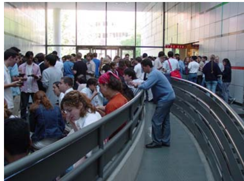
This special reception for graduate students offered not only food, but also the opportunity to borrow artwork for the year.