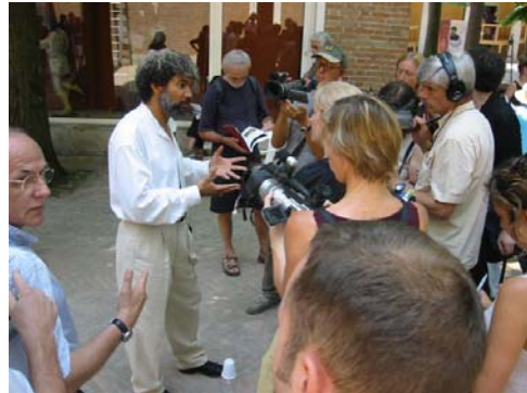
The international press meeting artist Fred Wilson at the Venice Biennale.

—Global press coverage of the US Pavilion at the Venice Biennale, organized by the List Center, was extraordinary. A minor sampling includes Artnet.com , Art Papers , Tema Celeste , Artforum , New York Times , Vanity Fair , Art Newspaper , Washington Post , International Herald Tribune , Chicago Sun-Times , Christian Science Monitor , Guardian , Economist , Village Voice , Miami Herald , Art Monthly Australia , Los Angeles Times , Flash Art International , and New York Magazine .