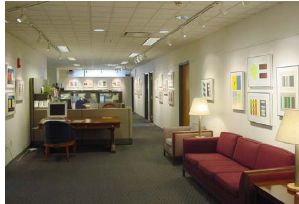
Josef Albers: Interaction of Color was the second in a series of installations to be installed in the Dean's Gallery at the Sloan School of Management.

Portfolio of color studies by this major abstract expressionist. These works will be placed throughout Simmons Hall.