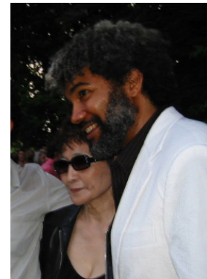
Fred Wilson with Yoko Ono at the LVAC dinner at the Venice Biennale.