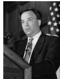
Mark B. McClellan.