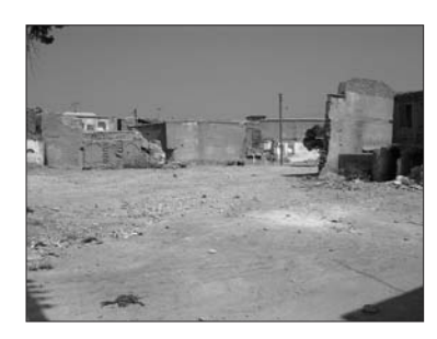
Fig.4 A demolished house in one of the old neighborhoods.

The restoration project aims to "clean up" the area around the bazaar and construct it as a tourist site, attracting national and international tourists as well as drawing the middle and upper classes back for visits. The project is itself a very selective interpretation of the city's past. While aiming at the valorization of several historical buildings that had been neglected or destroyed during the Pahlavi era, the project intends at the same time to wipe out all that was built in that period. The project also envisages a substantial reconfiguration of the commercial activities in the area.