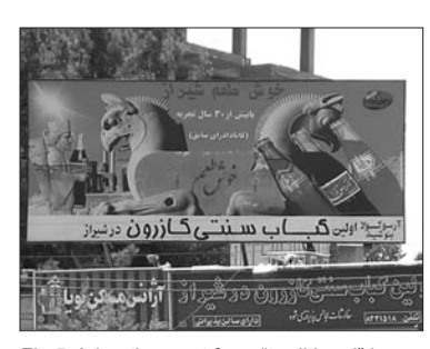
Fig. 5 Advertisement for a "traditional" kebab restaurant, with an Achaemenid soldier