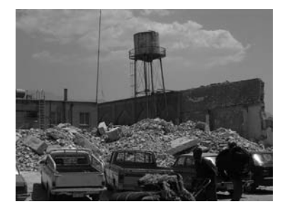
Fig.3 Ruins of the central post office built in the 1930s; in the background, a wall of one of the administrative buildings of the Karim Khan epoch.