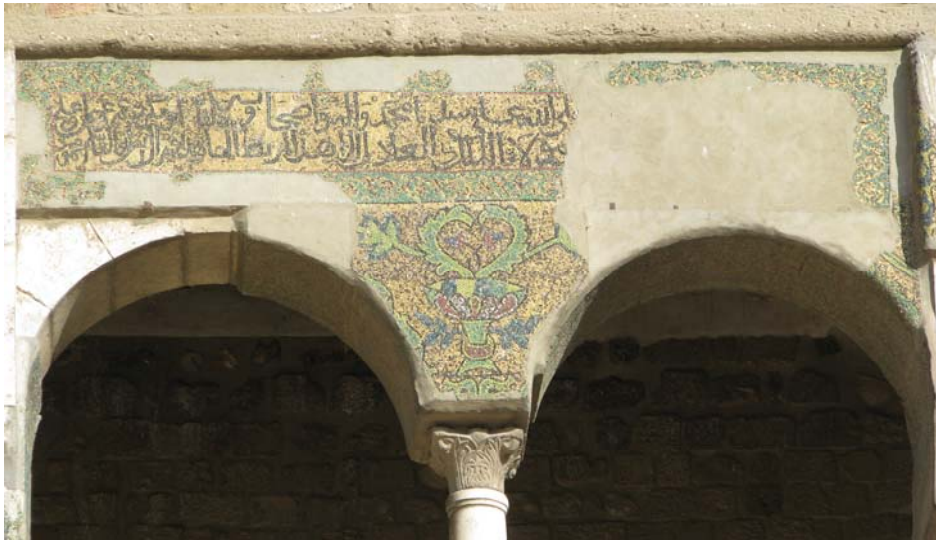
Fig. 05 – Damascus, Umayyad mosque, mosaic inscription by Nur al-Din Mahmud, probably after the earthquakes.

The establishment of endowments became an immediate concern for the rulers, as evidenced by al-Isfahani's record of the hundred dilapidated mosques that Nur al-Din Mahmud began to reconstruct (fig. 05), to each of which he assigned a supporting waqf . Under his rule the number of waqfs increased considerably. 17 The extensive building program even included construction work in small and medium-sized cities, such as al-Raqqā on the Euphrates (fig. 06), which were not immediately affected by the series of devastating earthquakes that took place in Syria in 1152 and between 1156 and 1159. Nur al-Din Mahmud now ordered their reconstruction. In accordance with al-Isfahani, Abu Shama states that Nur al-Din Mahmud endowed a separate waqf for each institution.