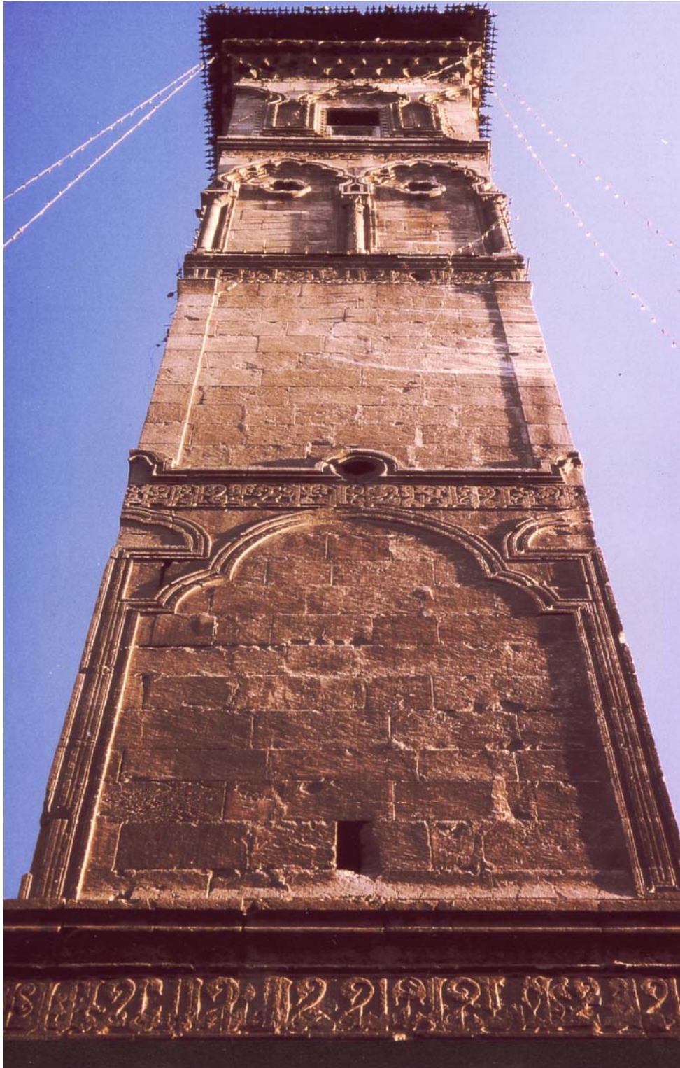
Fig. 01 – Aleppo, minaret of the Umayyad mosque, built between 1089 and 1094 in the name of the Seljuq Sultan Tutush (photo author).