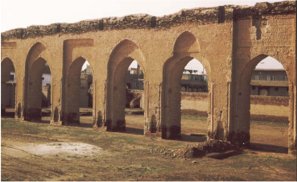
Fig. o6 – al-Raqqa, façade of the congregational mosque with restoration inscription of Nur al-Din Mahmud, dated 561/1165-6. For more than a hundred years the mosque had lain in ruins.

In the time of Nur al-Din Mahmud, the office of the “administrator of the supervision of the waqfs ,” the mutawalli nazr al-awqaf , seems to be either newly created or is emphasized for the first time in the reports of this period. Its duty was to supervise and control those institutions that the waqf made financially independent from the ruler, and to align them with the goals of the Zangid policy.