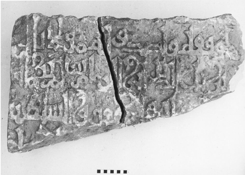
Fig. 02 – al-Raqqa, waqf inscription of an ʿ Uqaylid amir, first third of the 6 th /12 th century.

conquest of Syria only occasionally mention endowments, of which references very few were established by rulers or members of the ruling elite. 12 The early Seljuq policy of the Sunni renaissance included the establishment of schools of higher learning, madrasas , and of convents for the mystic Sufis , khanqahs . These new establishments were usually supported by waqfs . Educational policy and spiritual care were the main motivations behind this wave of endowments. The first Seljuq sultans, however, did not take the initiative for their establishment but were set up by governors, viziers, and others. Farm land leased to peasants formed the main financial base of these waqfs . 13