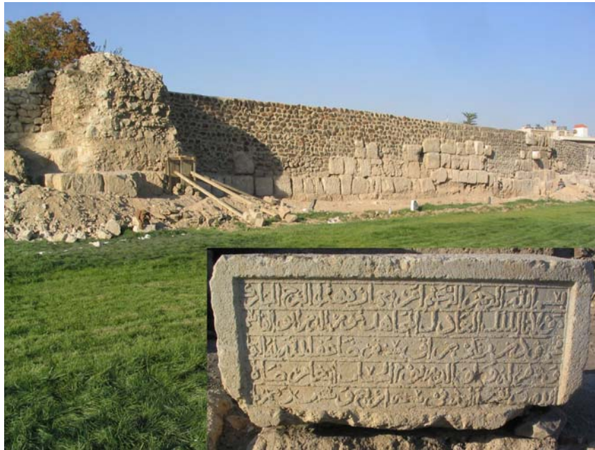
Fig. 03 – Damascus, city wall restored by Nur al-Din Mahmud, building inscription 564/1168-9 (photo author).