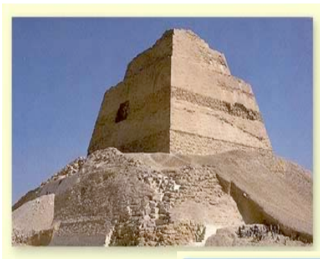
Pharaoh Sneferu's Pyramid project

“The concept of failure is central to design process, and it is by thinking in terms of obviating failure that successful designs are achieved...” [Petroski]