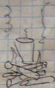
The cardboard bonfire