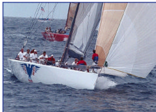
America 3 crosses the finish line to win in 1992.