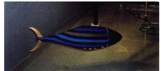
The MIT RoboTuna