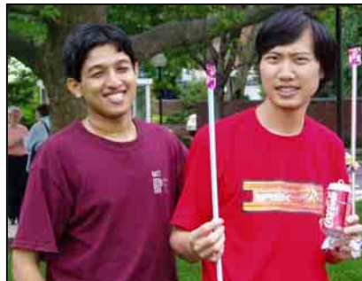
Hey, Gimme that Pixie Stick!