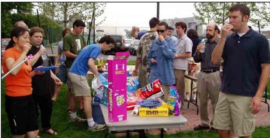
Yum... Yum.... Yum.... Too bad we don't have BBQs like this all the time!