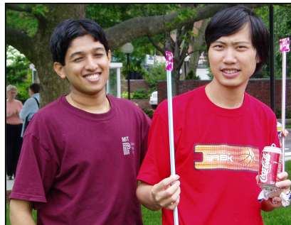
Hey, Gimme that Pixie Stick!