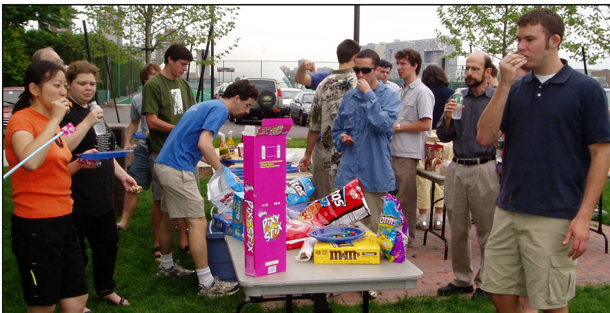
Yum... Yum.... Yum.... Too bad we don't have BBQs like this all the time!