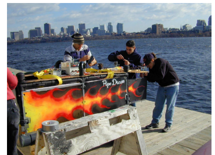
The final touches.

By the test date in mid-November, the SWATH was able to move on its own power via remote-controlled directions from shore. Problems with the electronics during the test date prevented extensive testing or sensor recording. Also, the pitch control was not successfully implemented. The remainder of the term was spent writing the final report and preparing for their presentation. Despite unavoidable setbacks during the year, both the students and instructors were pleased with the results.